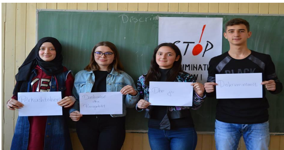
Image.1. Taken from follow up workshop

In this way, youth organisations can expand and enhance the opportunities offered to young people and youth workers – enabling them to gain new insights, as a result of exposure to different experiences and settings.