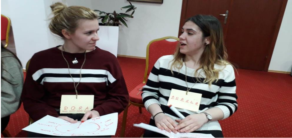
Image.2. Taken during the training “Violent Extremism vs Intercultural Dialogue and Peace

When youth workers, educators and others who have professional relationships view young people in this way, it releases the potential for young people to develop their understanding of the world around them and to use their skills (including critical thinking skills) to work in partnership with adults to bring about social change.