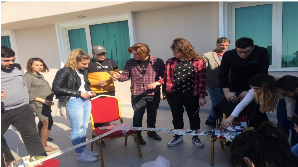
Image.3. Taken during the training “Violent Extremism vs Intercultural Dialogue and Peace

The methods that are best suited to reaching the goals of intercultural learning involve an experiential learning approach. When selecting methods, facilitators need to take into account participants' needs and the learning objectives, as well as their personal preferences and skills as facilitators. Using a method that the facilitator is not comfortable with or does not fully understand can lead to poor facilitation, which in turn leaves participants wondering how or why they have to do the activity. Moreover, the methods should facilitate interaction and authentic dialogue and in no way replicate inequitable dynamics in the activity. This means ensuring that people do not feel excluded and that participants do not act on their stereotypes, or at least not without the facilitator being aware of these manifestations and addressing them in a constructive way.